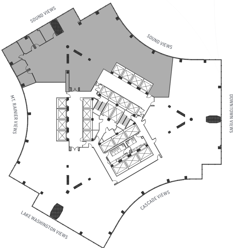
* HYPOTHETICAL BUILDOUT